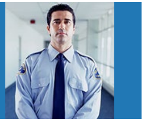
Monthly Ad Volume - Security Guards, December 2008 to December 2012

NYC'S TRAVELER ACCOMMODATION INDUSTRY REAL-TIME LMI REPORT WINTER 2013