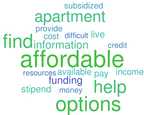
Figure 3: Word cloud - What additional resources or assistance would you like to see?