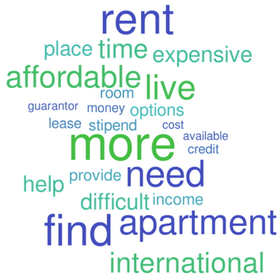
Figure 4: Word cloud - comments regarding your current or future housing needs