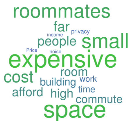
Figure 2: Word cloud - what makes it unsatisfactory?