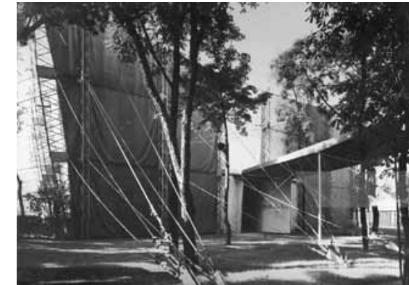
Fig. 5.119 Pavillon des Temps Nouveaux at the Exposition Internationale, Paris. 1937. General view from the entrance side. Fondation Le Corbusier, Paris. FLC L2-13-74

him what he considered to be a poor alternative site, he at first refused. However, wooed and reinvigorated by the victorious Left, Le Corbusier decided to turn the relative paucity of space, time, and funds to advantage. He conceived his pavilion at the Porte Maillot annex as a large, simple, tent-like structure of wood, steel, and brightly colored canvas, anchored by highly visible metal cables (fig. 5.119). (The idea of using water-resistant canvas apparently came from his cousin and frequent collaborator, Pierre Jeanneret, who had recently experimented with temporary structures for the Communist Party's Fête de l'Humanité.) 3