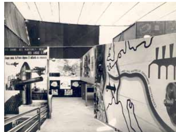
Fig. 5.121 Pavillon des Temps Nouveaux at the Exposition Internationale, Paris, 1937. View of the second floor toward the Plan of Paris <Plan Voisin for Paris?>. Fondation Le Corbusier, Paris. FLC I2-13-126