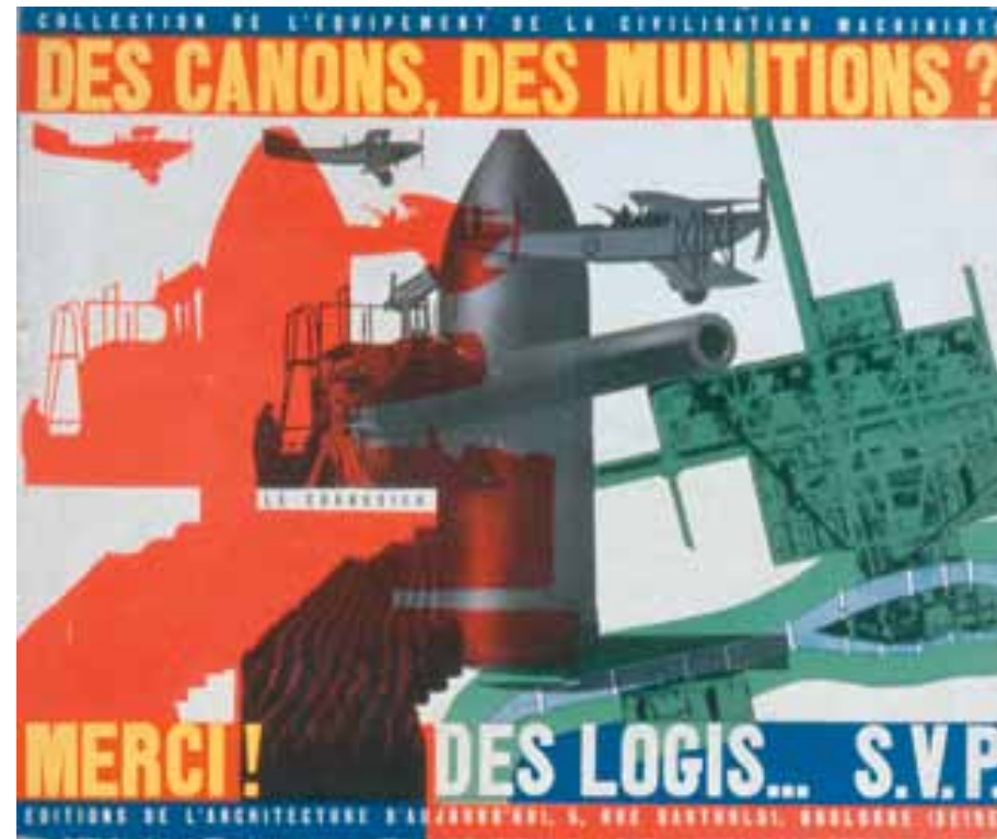
Fig. 5.120 Cover of Des canons, des munitions? Merci! Des logis... S.V.P! (Boulogne: Éditions de l'Architecture d'aujourd'hui, 1938). Fondation Le Corbusier, Paris <FLC #?>

By the time he designed his Pavillon des Temps Nouveaux for the 1937 Exposition Internationale in Paris, Le Corbusier was internationally recognized as a master at proclaiming, debating, and disseminating architectural matters via images. Only now did he deploy this gift for pictorial rhetoric before a vast public and on a truly large scale: two levels of ramps connecting a series of platforms took the visitor on a promenade along 17,000 square feet (1,600 square meters) of photomurals (fig. 1) <5.118>. 1