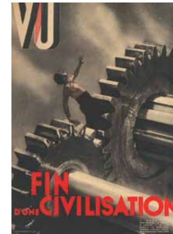
Fig. 5.124 Cover photomontage of the magazine Vu (March 1933), featuring a worker about to be ground between the teeth of an engine. From the personal archives of Le Corbusier. Fondation Le Corbusier, Paris <FLC #?>

manifested in the solid red, blue, green, and yellow color scheme of the tent interior (its floor covered with yellow gravel) and in the accent of colors in the four photomurals (which Le Corbusier actually referred to as "paintings") displayed in the quadrangular space devoted to the visualization of the four functions of urbanism: Work, Recreation, Dwelling, Transportation . Work , by Fernand Léger, jarred the senses with huge close-ups of mechanical parts (fig. 6) <5.123>. In the middle of the composition, a worker is tightening the giant bolts of an electric motor larger than himself; this image, drawn from La France travaille , a compendium of more than ten thousand photographs taken by François Kollar in 1932, was the perfect emblem of the "socialisme personaliste," the Socialism respectful of the individual, advocated by Léon Blum. It reads like a modern evocation of Leonardo's Vitruvian Man (c. 1490), standing at the epicenter of a mechanical landscape but still the measure of all things. Here was a pointed response, on the part of Léger and Le Corbusier, to the downbeat images of mechanization disseminated in the press in the years after the Wall Street crash of 1929, such as the March 1933 cover of the illustrated magazine Vu : a montage of a worker about to be ground between the teeth of an engine, captioned "Fin d'une civilisation" (End of a civilization) (fig. 7) <5.124>.