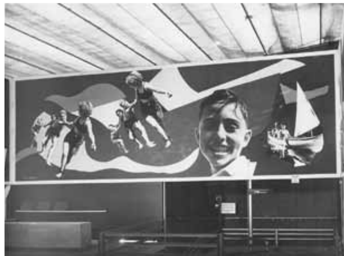
Fig. 5.125 Pavillon des Temps Nouveaux at the Exposition Internationale, Paris, 1937. View of Lucien Mazenod's photomural Recréer (Leisure<Recreation?>). Fondation Le Corbusier, Paris. FLC L2-13-152