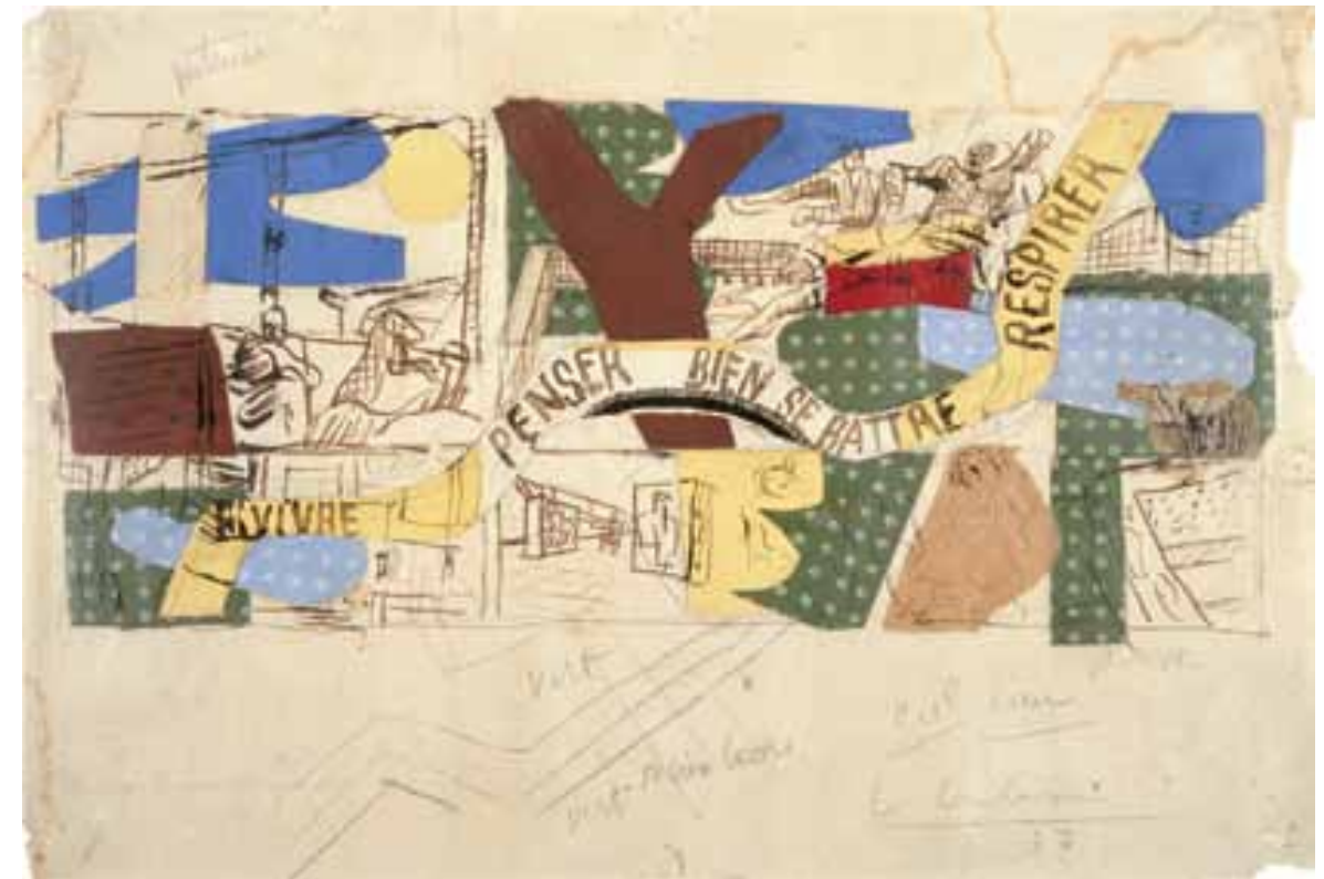
Plate 5.100 Pavillon Temps Nouveaux 1937 "Habiter" 1937 (from log)