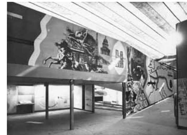
Fig. 5.122 Pavillon des Temps Nouveaux at the Exposition Internationale, Paris, 1937. View of the ground floor with the ramp leading to the section on the Îlot Insalubre No. 6. Fondation Le Corbusier, Paris. FLC L2-13-137

As they moved along the ramps, fairgoers were introduced first to his Plan de Paris 37 (which he was about to present at the fifth CIAM conference), then, in spirited succession, his myriad ongoing plans: his Stadium for 100,000 Spectators, a park, a summer camp, a nursery school, a high school, a modernized farm, and a cooperative village. Le Corbusier deployed every type of imagery at his disposal to make his point, juxtaposing aerial views of the Roman Coliseum with arrays of Gothic spires jumbled with those of American skyscrapers and his own (“Cartesian”) high-rises, men and women at work in city streets, in fields, and in domestic interiors, mingling with blow-ups of Brueghel paintings, medieval prints, diagrams, newspaper cartoons, and caricatures. Rather than offering an encyclopedic overview of urbanism, he provided what he called a sampling (the French word is “échantillonnage”) of the possibilities offered by modern urbanism, and left it to the viewer to pull together the necessary threads. It was a creative take on the pedestrian “timeline”; had it caught the attention of Anthony Grafton and Daniel Rosenberg in their recent book Cartographies of Time , Le Corbusier’s effort might have been included among those inspired timelines that blurred the line between charts and art. 10