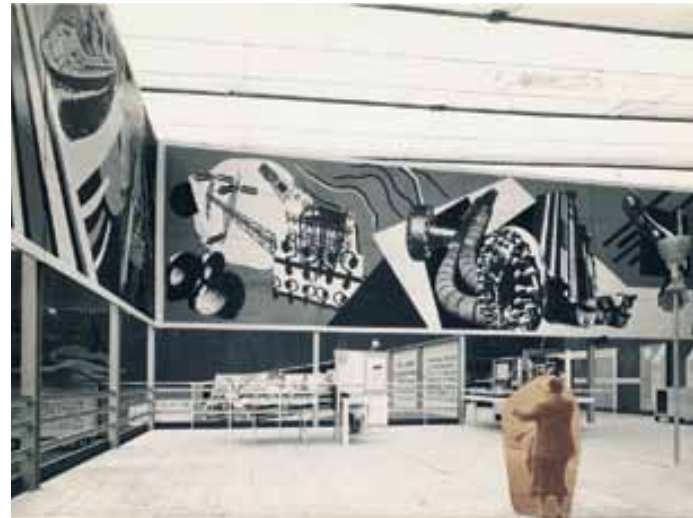
Fig. 5.123 Pavillon des Temps Nouveaux at the Exposition Internationale, Paris, 1937. View of Fernand Léger's photomural Travailler (Working<Work?>). Fondation Le Corbusier, Paris. FLC L2-13-146