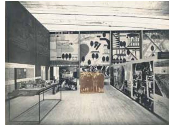
Fig. 5.118 Pavillon des Temps Nouveaux at the Exposition Internationale, Paris. 1937. Main axis of the second floor with the panels on Living and Leisure. Fondation Le Corbusier, Paris. FLC L2-13-120