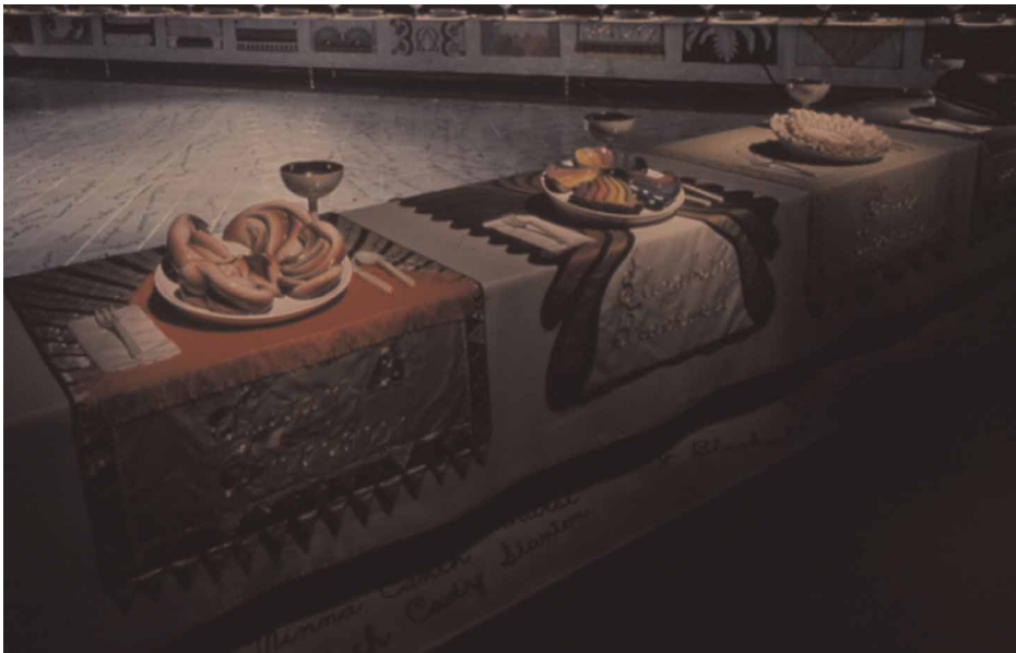
FIGURE 3 Judy Chicago, The Dinner Party (detail), 1979, Mixed media. The Brooklyn Museum of Art. Reproduced with kind permission of Judy Chicago.

Bloom stumbles in another respect when it comes to Chicago's monumental feminist construct The Dinner Party : inspired by Leonardo's Last Supper according to the artist, which has led interpreters, and now Bloom, to deny the work any Jewish meaning (42). Yet the supper that became a Christian symbol began as a Passover